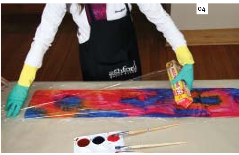
Place another piece of plastic cling film over the complete scarf.