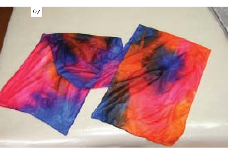
Rinse out and dry in the shade. Iron using the silk setting, while still damp.