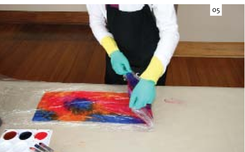
Fold in edges to make a parcel.