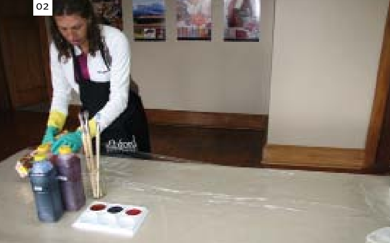
Lay out a length of cling film long enough to place the scarf on and enough to turn in edges.