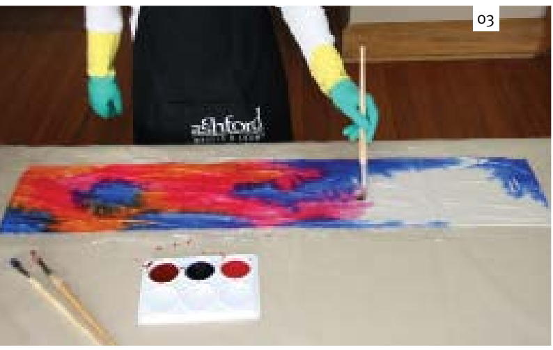
Lay out the scarf. Paint on your dyes, blending the colours together. Ensure the dye has covered the surface.