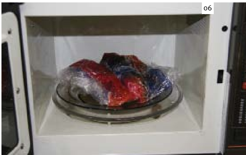
Put into the microwave and cook on high for 1 – 1 \frac{1}{2} mins. Allow to cool, before removing the plastic cling film.